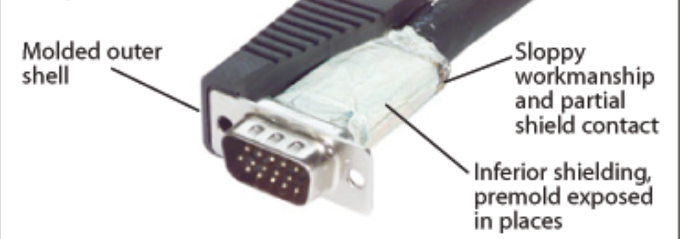
A cutaway view of a typical competitor's cable