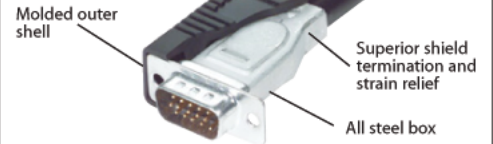
A cutaway view of one of L-com's premium cables